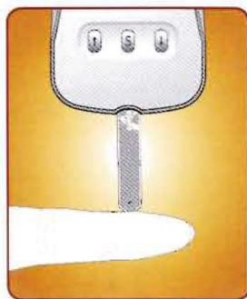
2 Apply blood sample