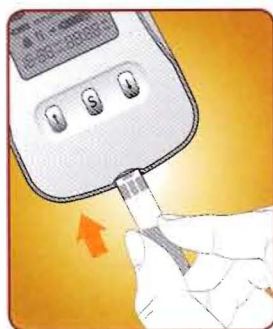
1 Insert test strip