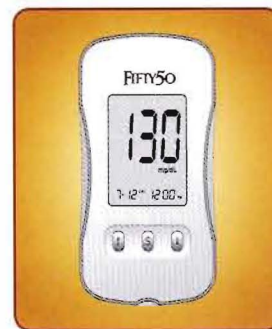
3 Result in 5 seconds